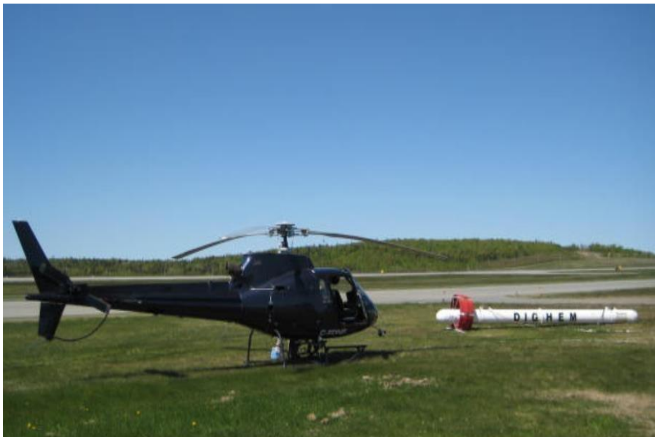
Figure 1 DIGHEM System

The DIGHEM system comprises a 30 m cable which tows a 9 m bird containing the EM transmitter and receiver coil pairs (three coplanar and two coaxial), a magnetometer, a laser altimeter and a GPS antenna for flight path recovery. The helicopter has a tail boom mounted GPS antenna for in-flight navigation, radar and barometric altimeters, a video camera and a data acquisition system.