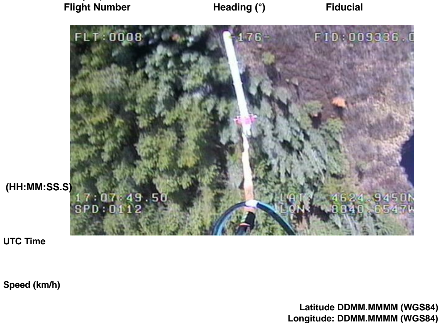
Figure 2 Flight path video

Laser altimeter data are despiked and filtered using an alpha-trim filter. The laser altimeter data are then subtracted from the GPS elevation to create a digital elevation model that is examined in grid format for spurious values. The laser does a better job of piercing the tree canopy than the radar altimeter, and was used in the resistivity/depth calculation.