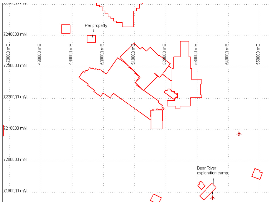
Figure 2: Location of the Per property, Bear River exploration camp and adjacent properties owned by Cash Minerals Ltd.